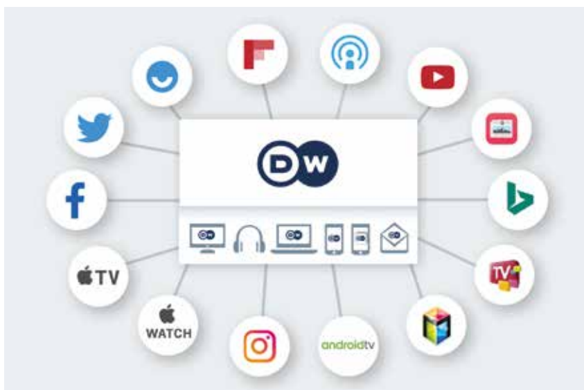
Figure 5: Platform diversity of DW services

content as possible available to people with disabilities. DW will primarily consider and implement the issue of accessibility for all when making technical purchases and offering new services—provided that this is technically and financially feasible.