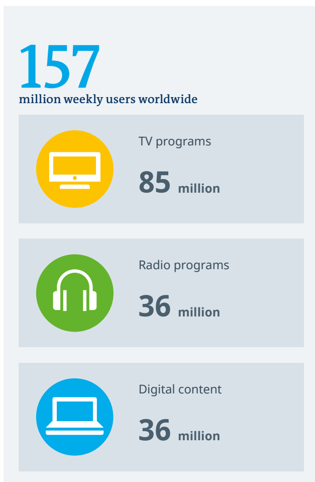
Figure 4: Number of weekly user-contacts per medium, 2017

However, the habits and expectations of the target groups are rapidly changing as part of digitalization. The increasingly intense competition for users' attention makes it even more necessary to focus on the target groups' interests and usage habits than ever before. They must be the focal point for planning, producing and distributing DW programs. Not least the attempt by a growing number of countries to make it hard for their populations to gain access to free information is increasing the need for action by overseas broadcasters that are viewed as democratic. DW and its DW Akademie will therefore focus on achieving the overall strategic measures outlined in the following chapter.