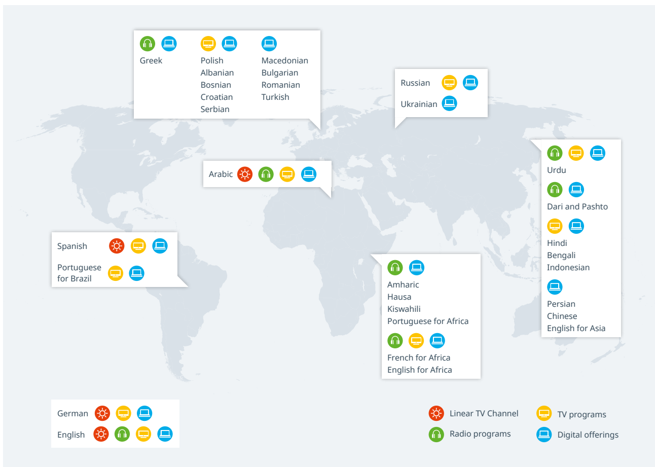
Figure 2: Overview of DW's TV, radio and digital services in 30 languages

Increasing censorship and blockade measures are swelling the proportion of people, for whom access to free information is difficult or even—at least temporarily—impossible. DW particularly needs to find ways here to reach the whole of civil society with its programs.