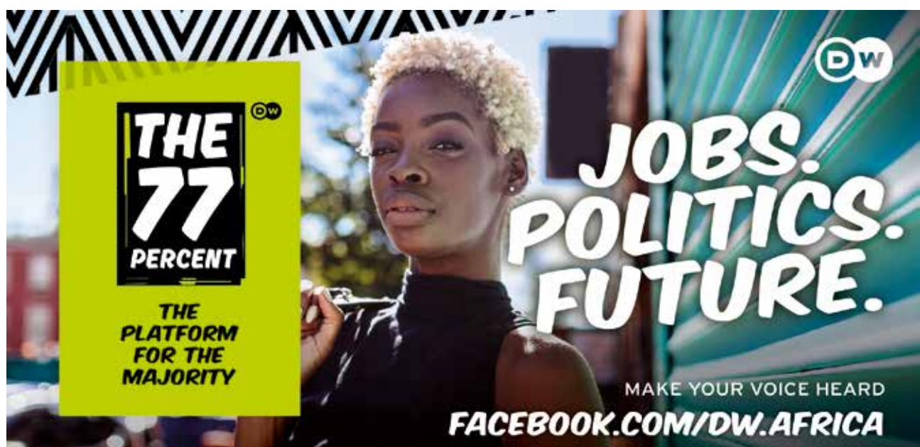
Figure 8: DW campaign introducing The 77 Percent

DW radio, TV, online and social media programs offer journalistic materials prepared in the international languages of English, French and Portuguese as well as in the regional languages of Hausa, Amharic and Swahili. The topics of migration and refugees are one major focus of reports. DW is increasing-