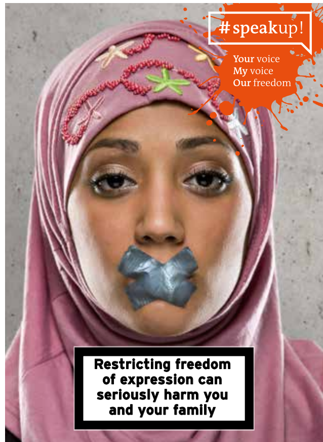
Figure 6: DW Akademie campaign (2017)