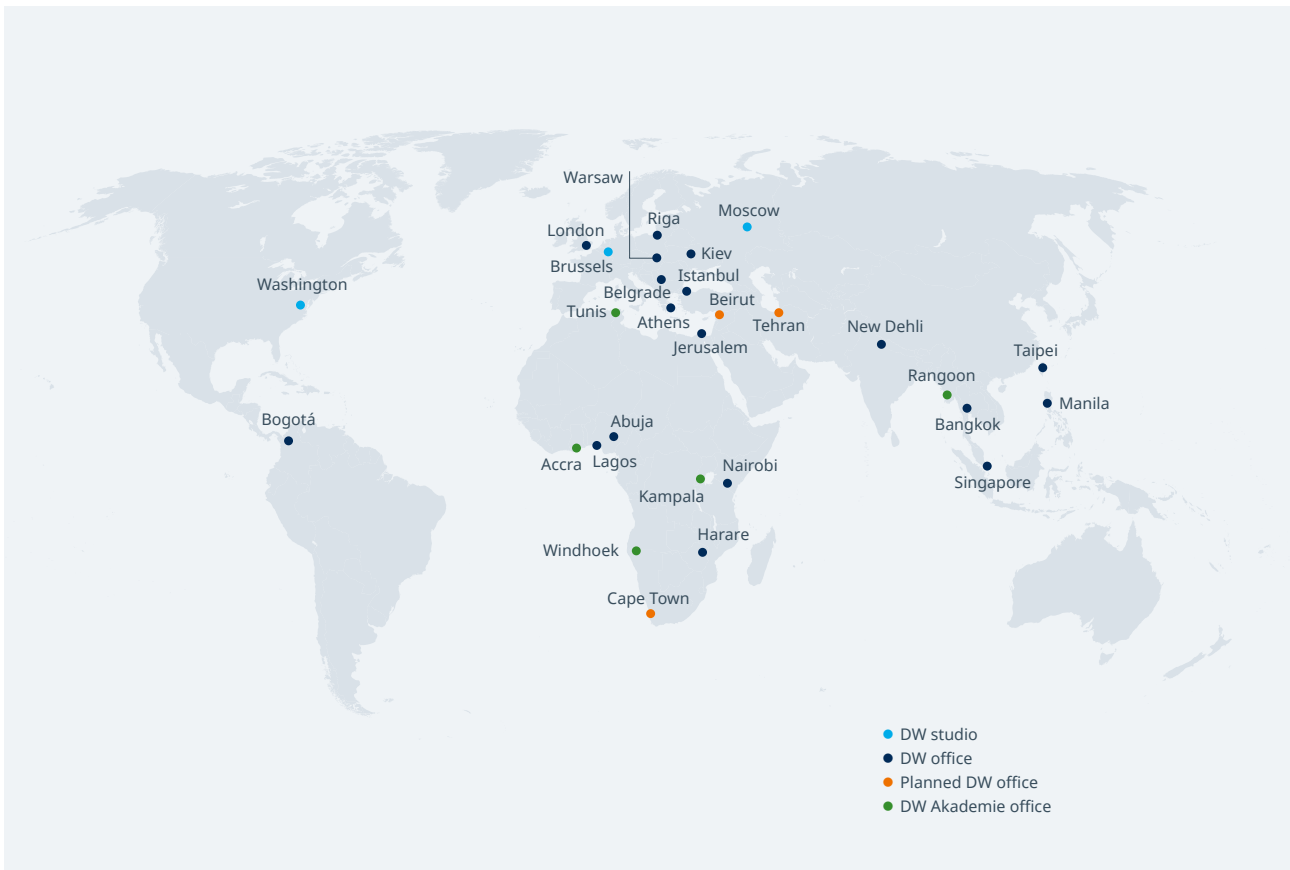
Figure 3: Existing and planned studios and offices of DW and the DW Akademie