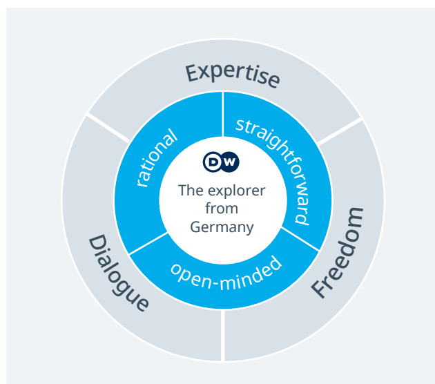
Figure 1: DW's Core Brand

In the light of virulent geopolitical challenges like terror, propaganda, refugees, migration, globalization, climate change and the growth in population, Germany's global media voice is becoming increasingly important. DW is using its journalistic programs to build a bridge to the free world, particularly in the target regions dominated by crises and religious and ethnic conflicts. On the basis of its mandate, its perception of itself and its central brand values of being "rational", "straightforward" and "open-minded," DW makes a contribution through providing extensive information to provide enlightenment, freedom of expression and strength in civil societies—both through dialogue and interaction. The media are experiencing what is often a dramatic loss in credibility and trust in more and more countries and find themselves confronted by the charge of providing disinformation to a degree not known in the past. This particularly affects regions, where state control, censorship and blockage measures are increasingly restricting the room for free media to maneuver. DW believes that it has an important duty to strengthen people's resilience to propaganda by providing independent, credible reporting and helping them form their own free opinions. The DW Akademie, an integral part of DW, is reinforcing this with its activities, particularly those for establishing media skills.